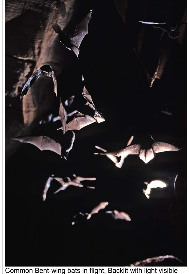
Common Bent-wing bats in flight, Backlit with light visible through their wings.

Small insects are caught directly in the mouth while larger insects are scooped up in the bats wing and transferred to the tail membrane ( Uropatagium ) and then the mouth. Large insects may be taken back to a feeding roost for disembowelment.