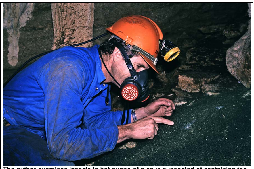
The author examines insects in bat guano of a cave suspected of containing the Histoplasmosis fungus © Garry K. Smith.

reduces, but not eliminate exposure. If you must enter a cave with high humidity and dry guano, a good fitting fine filter mask will reduce (but not entirely eliminate) the chance of infection. It is possible that the mask could be bumped, thus losing the air seal.